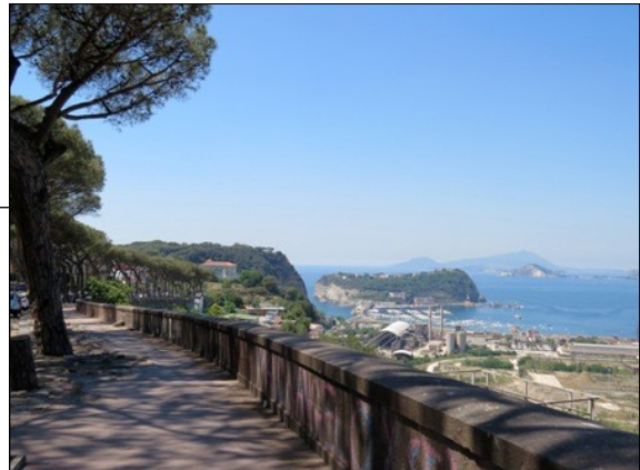
Overlooking the Bay of Naples