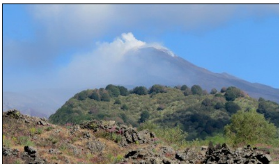
Mount Etna, Sicily

Looking towards the Three Sisters from the Isle of Capri - accessed via a cable car.