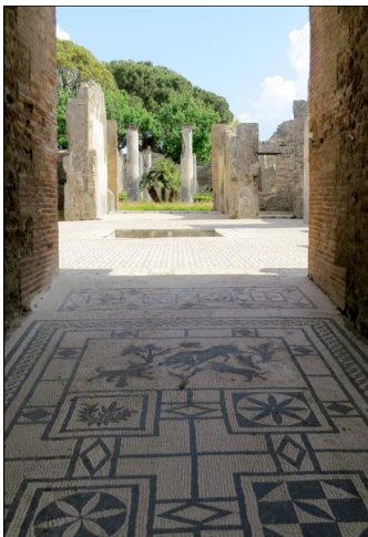
Mosaics in Villa Pompeii