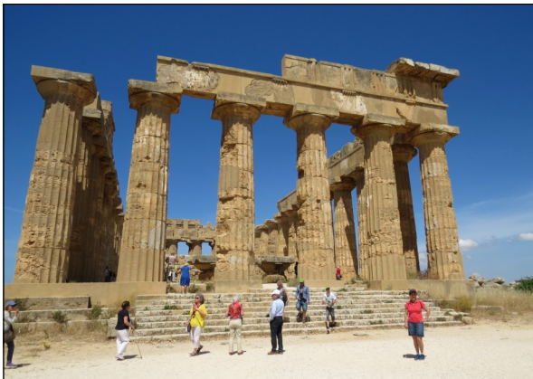
Selinunte Archaeological Park

With thanks to Pat Young for these photos.