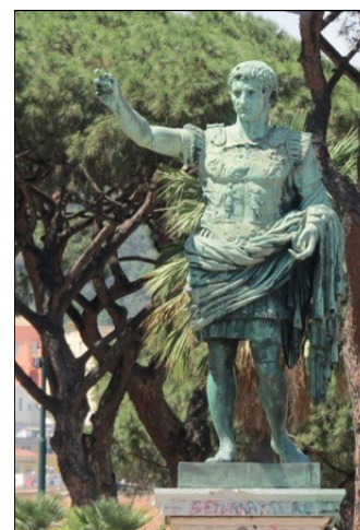
Julius Caesar Way