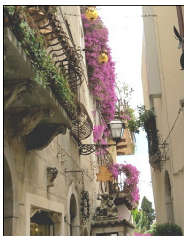
Street in Taormina